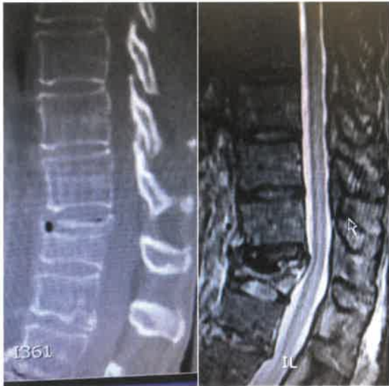
VCF (Vertebral Compression Fractures) when it goes untreated.